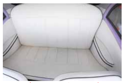
Interior from Newton Commercial in UK.