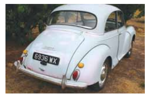
1000086 before the restoration began.

As part of the publicity drive, a competition was held to find the oldest surviving Morris Minor still on the road, with the winner receiving a Minor Million in return for their old clunker. Although entries were received from across the globe, the winner was Cyril Swift from Sheffield, England, who's car turned out to be chassis 501 – the very first production Morris Minor made. The car was eventually restored and now takes pride of place in the National Motor Heritage Centre at Gaydon.