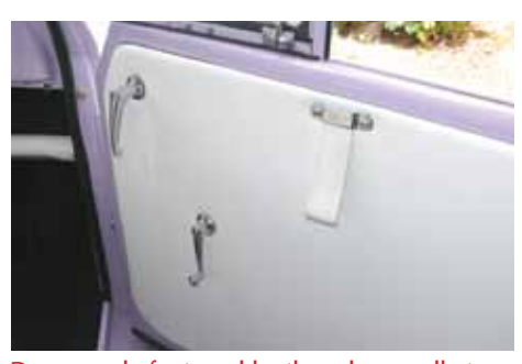
Door cards featured leather door-pull strap.