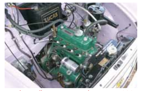
Mechanically same as regular Minor 1000.