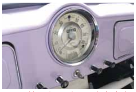
New-old-stock speedo was a lucky find.