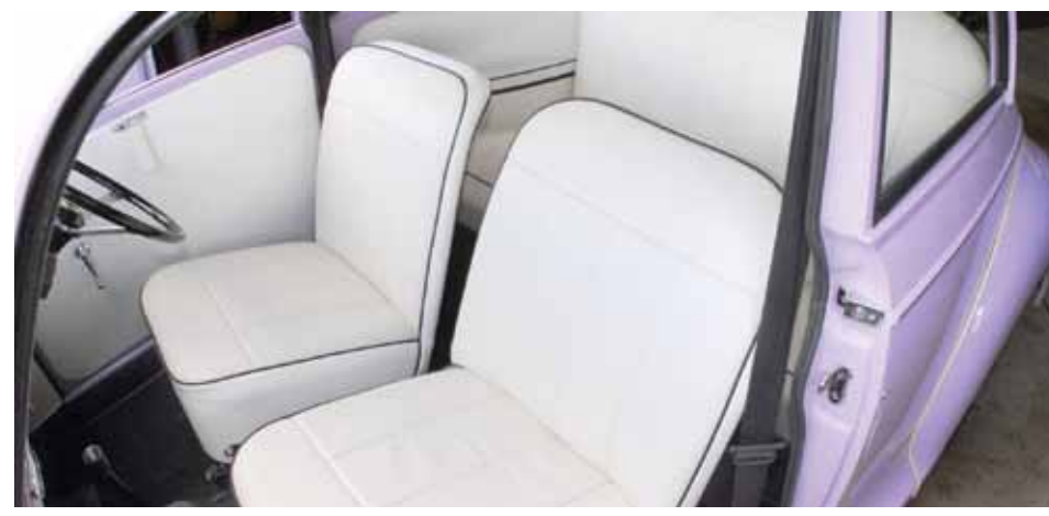
Interior trim is one of the key components of the Minor Million.

As often happens, that Minor led to more, with other restorations taking place – most notably a 1959 Traveller "Woodie", which has won many concours trophies at National Minor Rallies in the ensuing 20 years or so.